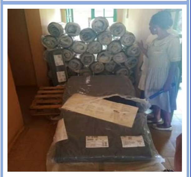
First shipment of mattresses arrive at Nixon Hospital.