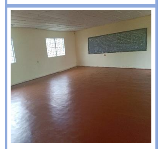
Refurbished learning space