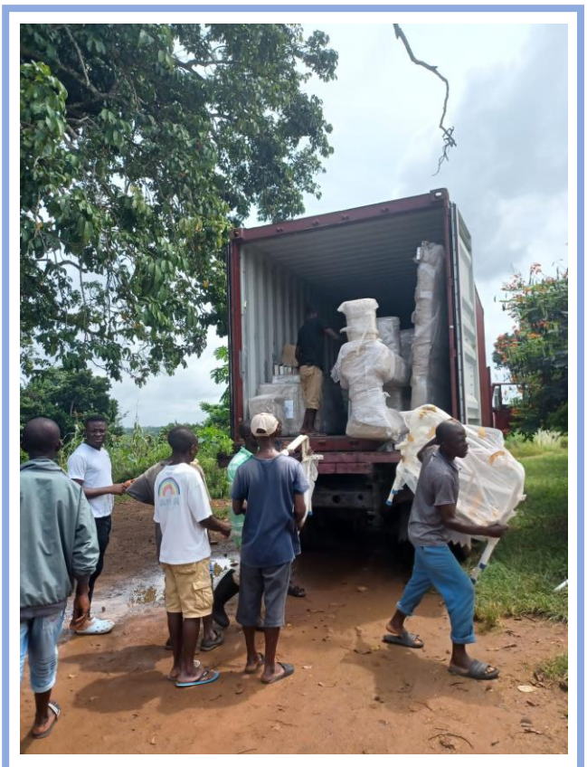
Amazing team work unloading the shipping container at Nixon Hospital.

The Skills Lab equipment is in place ready to be set up alongside the other elements necessary for the re-opening of the Nursing School and the Hospital await a qualified mortician to spend time ensuring the safe and accurate set up of the mortuary chambers in the renovated mortuary building. Both Nursing School and Mortuary are looking to be officially opened during 2024.