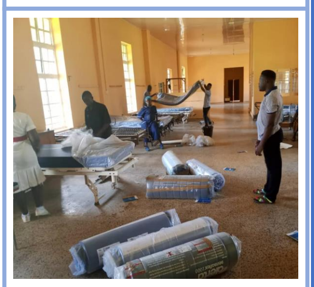
New mattresses being set up on wards.