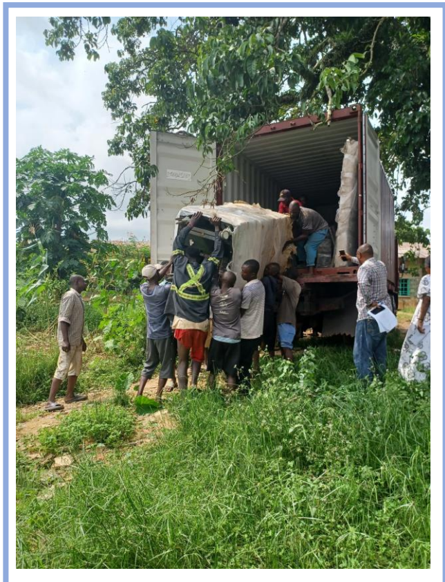
Mortuary chambers being transferred to the mortuary.