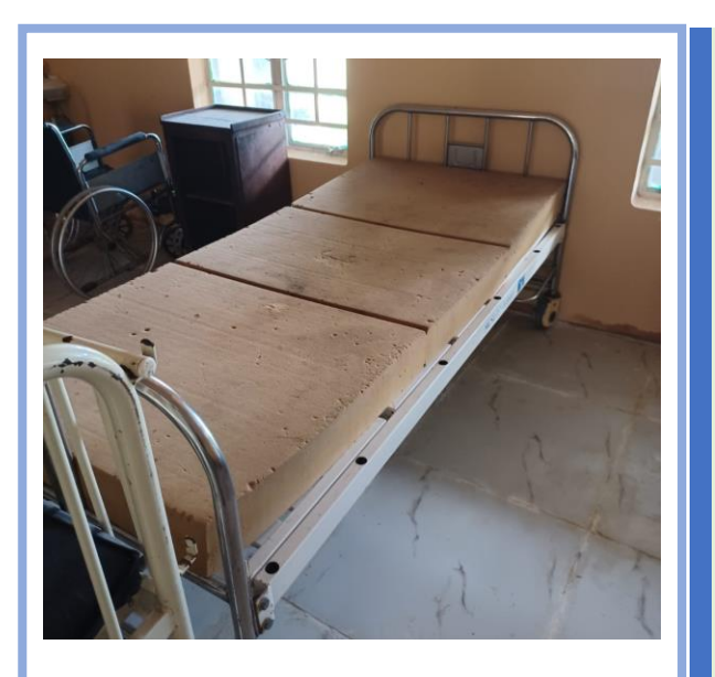
Mattresses currently in use